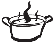
Authentic Pastas & Oils